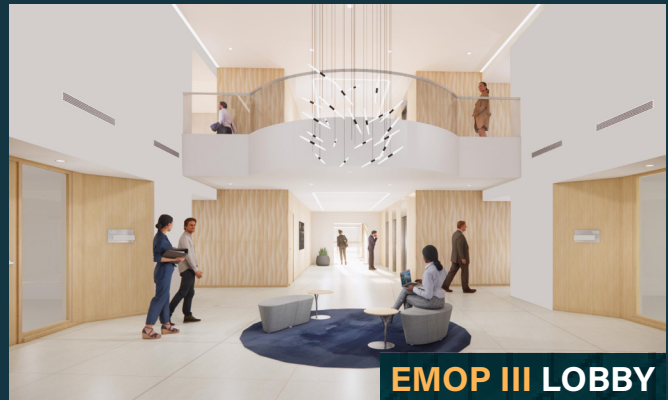
EMOP III LOBBY