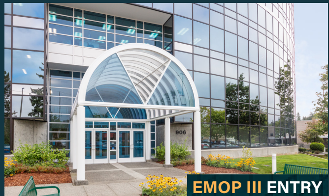
EMOP III ENTRY