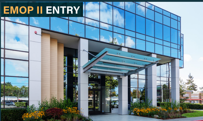
EMOP II ENTRY