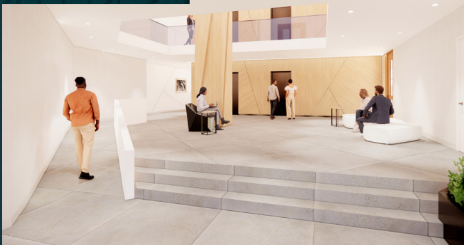
EMOP II LOBBY